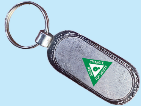
Novel Key Chain - S.No. 11