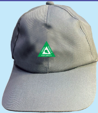
Cap - S.No. 08