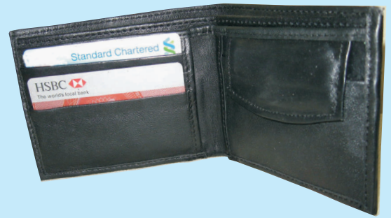
Leather Wallet - S.No. 09