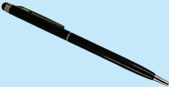
Ball Pen - S.No. 10