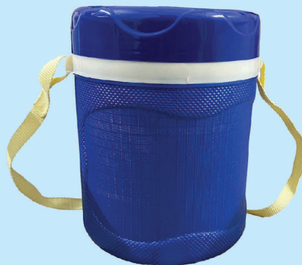
3 Layer Hot Box Carrier - S.No. 13